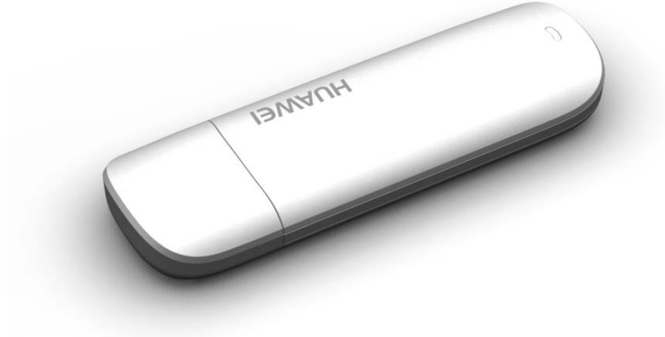
Figure 1-1 E173 profile

Figure 1-1 shows the profile of the E173.